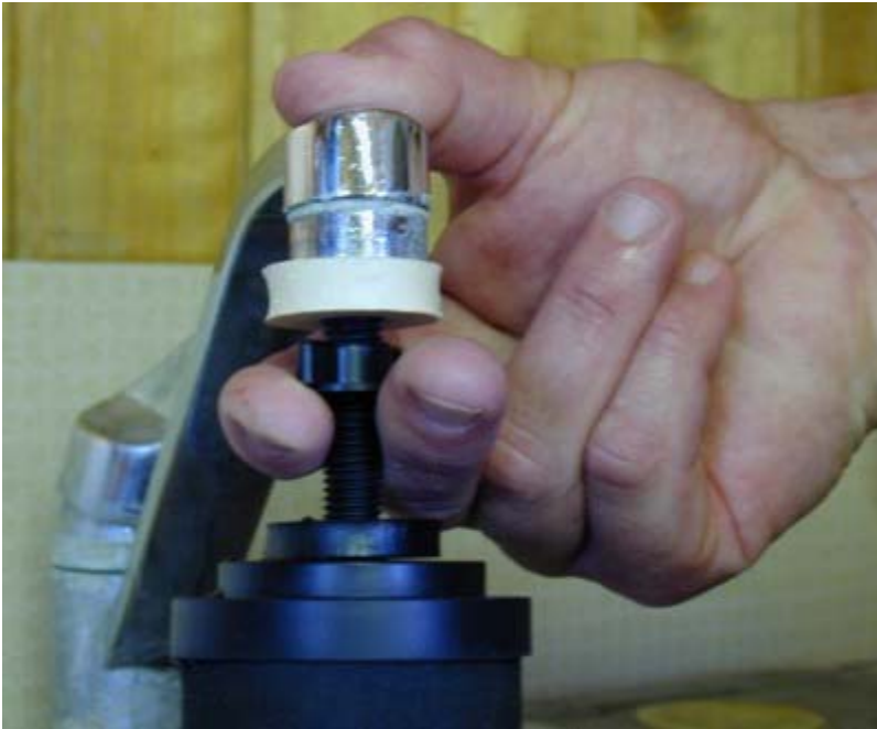
Figure 2 - Place Your Black Berkey Up to Your Faucet for Priming