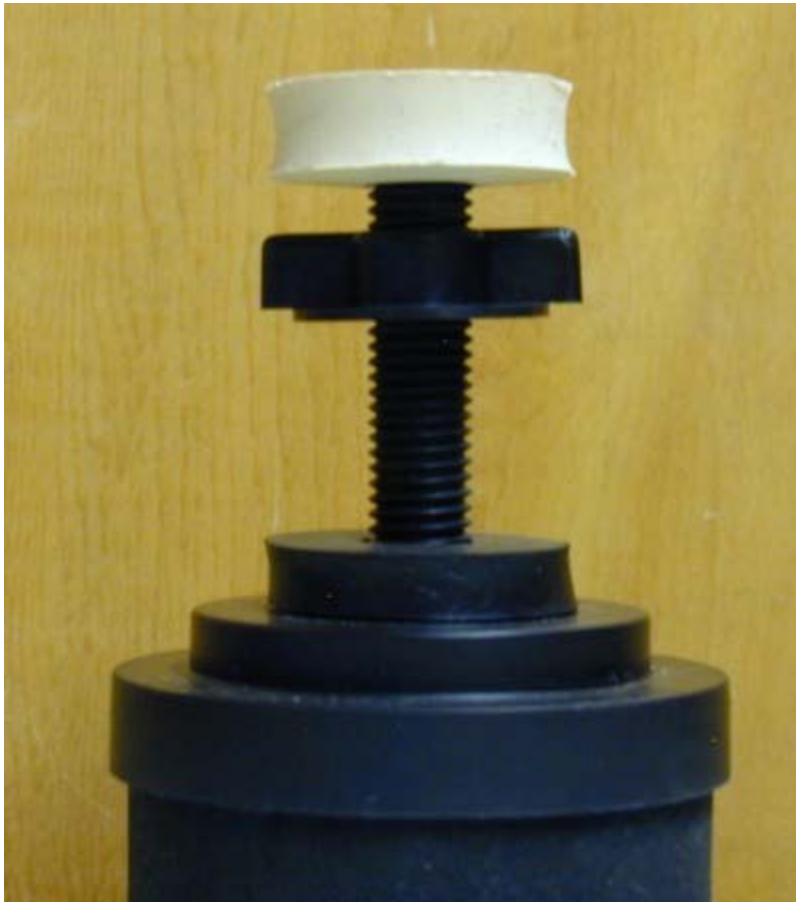
Figure 1 - Black Berkey with Tan Priming Button

Whether you are using a Berkey Light , a Royal Berkey , or any of the other Berkey systems that utilize the Black Berkey purification element, priming is required due to the extremely small pores that make up the filter. These elements need to have water forced through them to clear the air that has been trapped inside the micro fine pores during production. Begin by opening up your black berkey box and verify that each element has a rubber washer and a wing nut attached to it. Also inside the box you'll find your priming button, a tan rubber washer. It will be thicker than the element washer with a smaller center hole. See Figure 1.